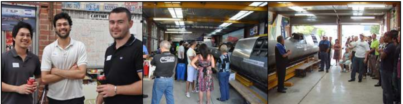
For more images of the BBQ visit http://www.aussieinvader.com/attachments/Image/Latest_News/bbq_montage.jpg

The evening BBQ was a huge success with a guest list of over 70 people and the night's festivities were well catered for with great food and wine by our newly found sponsors Mondo Meats ( http://www.mondo.net.au/ ) and Sandalford Winery ( http://www.sandalford.com/ ) with lots of arranging performed by Alex Blain and Loco TV ( http://www.locotv.com.au/ ).