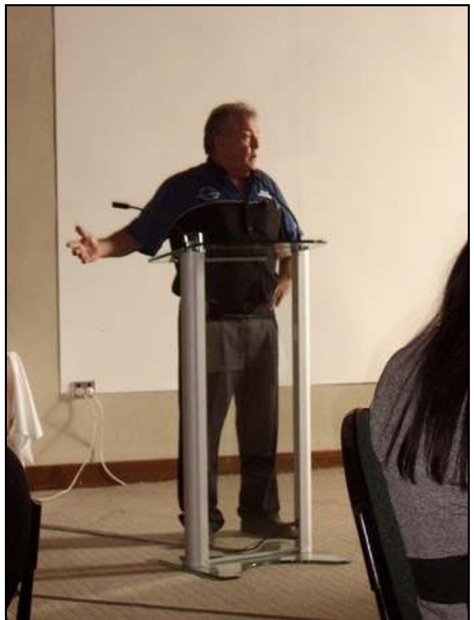
Speaking at the Alcoa Apprentice Awards Night