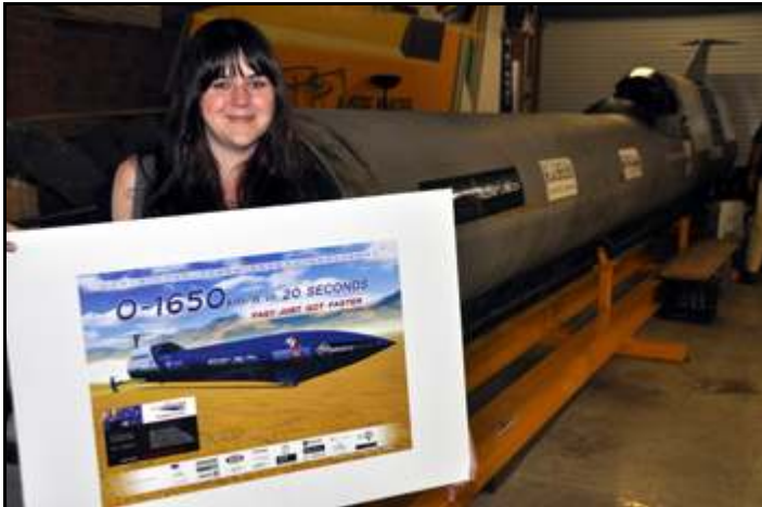
Poster design by Katie Beese - http://www.katiebeese.com

Support the sponsors who support us - visit http://www.aussieinvader.com/the_sponsors.php