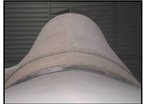
6. Canopy plug ready for moulding