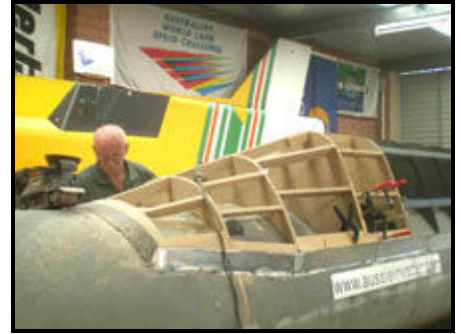
3. Final assembly of the MDF frame