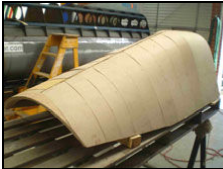
4. Finished frame sheeted in 3mm MDF